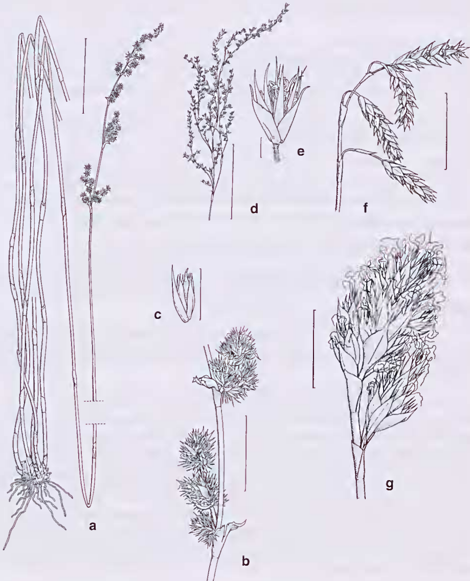
Fig. 8. a-e, Dapsilanthus elatior , a-c, female: a, habit. b, inflorescence. c, capsule with tepals and glume (disseminule) (Clarkson 4995). d, e, male: d, inflorescence, e, spikelet (Cowie 3222). f, g, Apodasmia brownii , f, male spikelets (Beaglehole 1995b); g, female, part of inflorescence (Briggs 2922). Scale bars: a, d = 5 cm; b = 1 cm; c, e = 1 mm; f = 7 mm; g = 14 mm.

Four species; three in seasonally wet sites in northern Australia and monsoonal areas of southern New Guinea (two of these also in the Aru Islands), as well as one species in south-east Asia (Malaysia, Cambodia, Thailand and the southeastern Chinese island of Hainan).